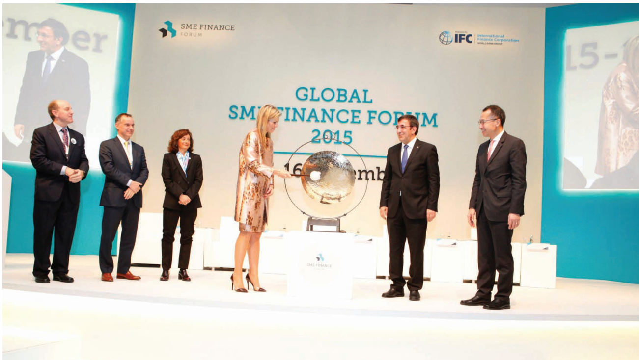
Her Majesty Queen Máxima and Turkish Deputy PM Cevdet Tilmaz launching the SME Finance Forum member network.

This year, we are particularly excited to announce the launch of the SME Finance Forum global member network. Our founding members include financial institutions, technology companies, and development finance institutions that share a strong commitment to promote the growth of small businesses. We hope that our members will unite in sharing knowledge, promoting innovation and providing a new voice in the SME finance policy discourse.