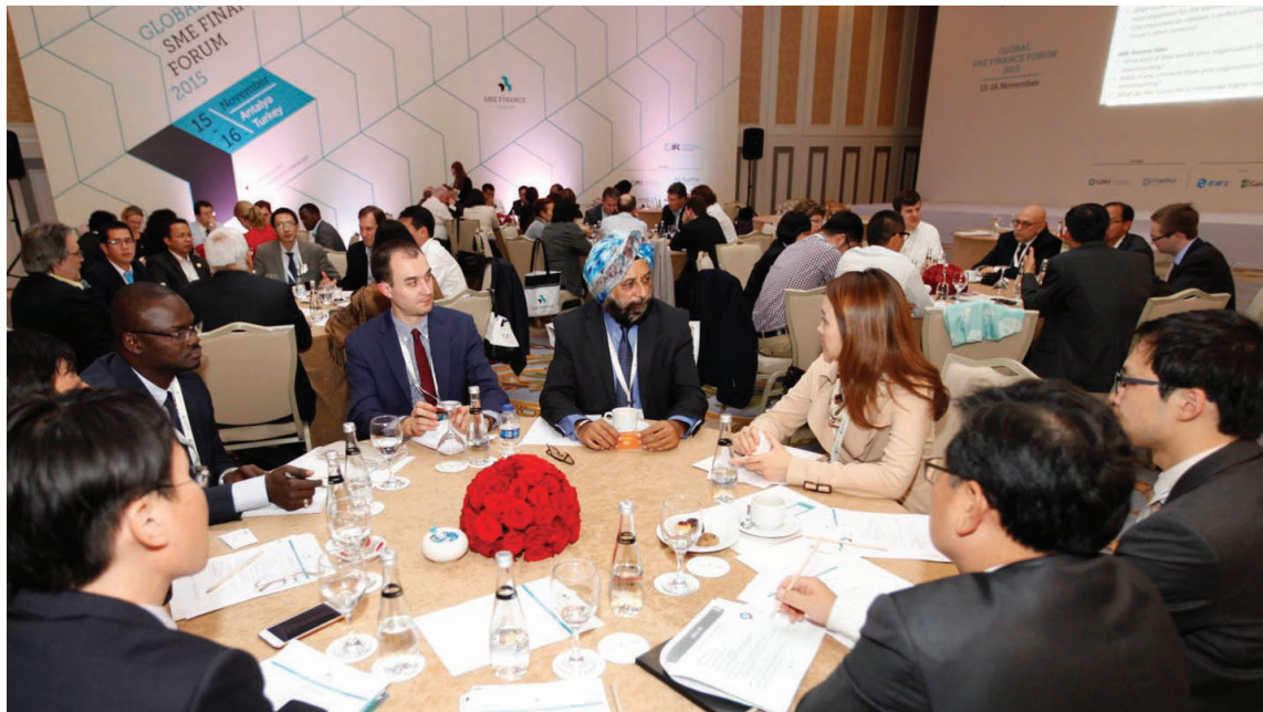
Members Meeting at the 2015 Global SME Finance Forum.