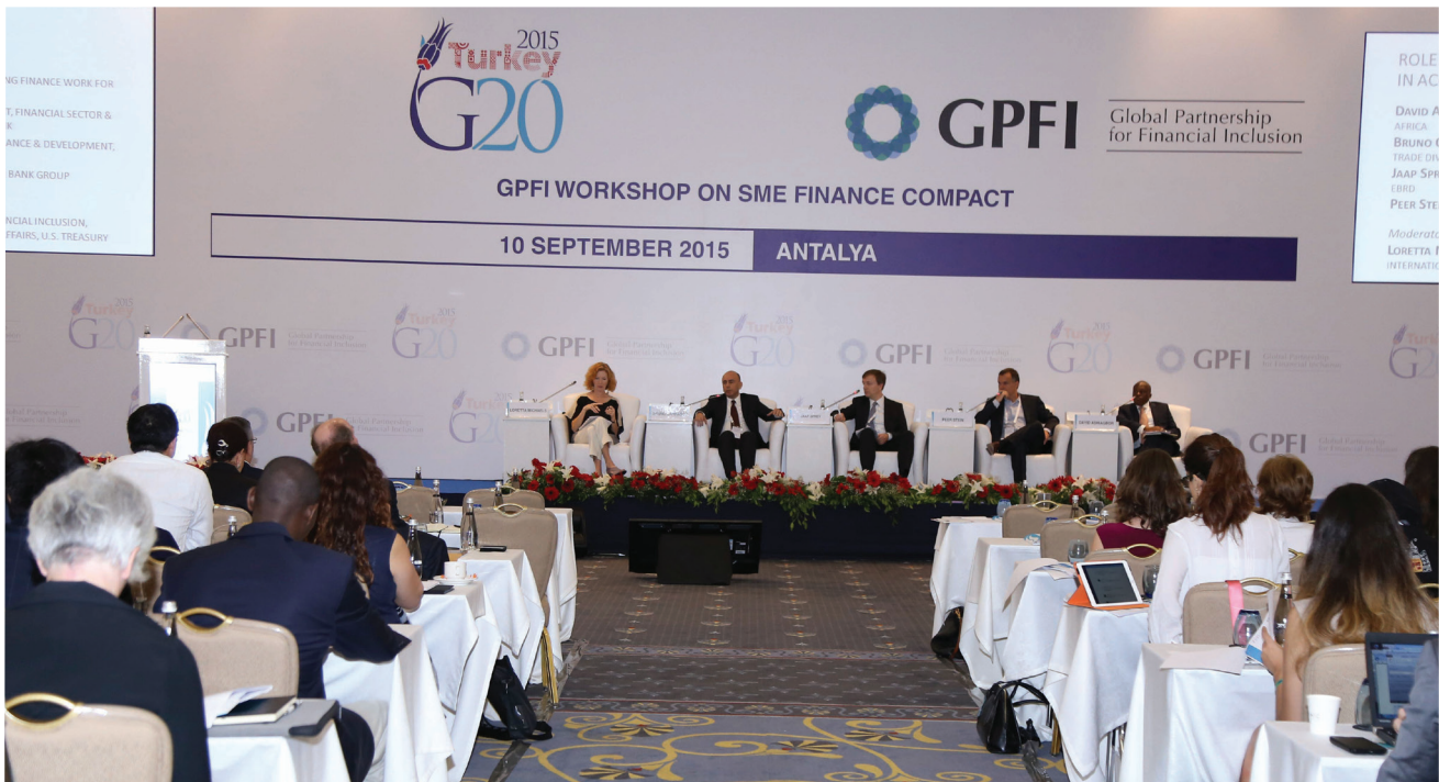
G20 event organized by the SME Finance Forum in Antalya, Turkey.

The Forum hosted two events focusing on gender and SME finance. In an effort to facilitate gender-disaggregated financial and SME data, the Forum hosted a meeting with the Gender Global Entrepreneurship Development Institute (GEDi) / the Global Women Entrepreneur Leaders (GWEL)