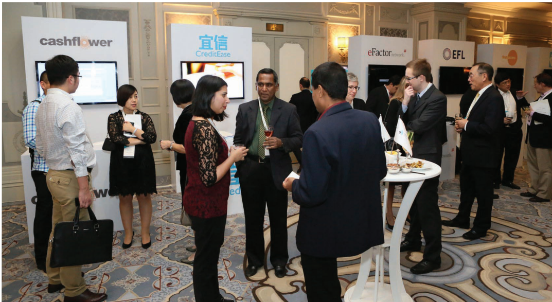
Fintech expo at the 2015 Global SME Finance Forum.

In addition to organizing events, the SME Finance Forum actively supported and contributed to events hosted by the APEC Business Advisory Council, the B20 Coalition, the Business and Industry Advisory Committee of the OECD, Finovate, the International Finance Corporation, Innoribe, Inter-American Investment Corporation, G7 Deauville Partnership and the Alliance for Financial Inclusion (AFI).